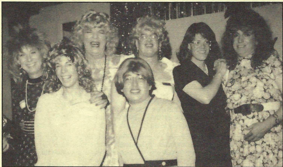
In June the 1991-1992 ETVC officers assumed their new roles. Pictured above are most of the new and returning officers.