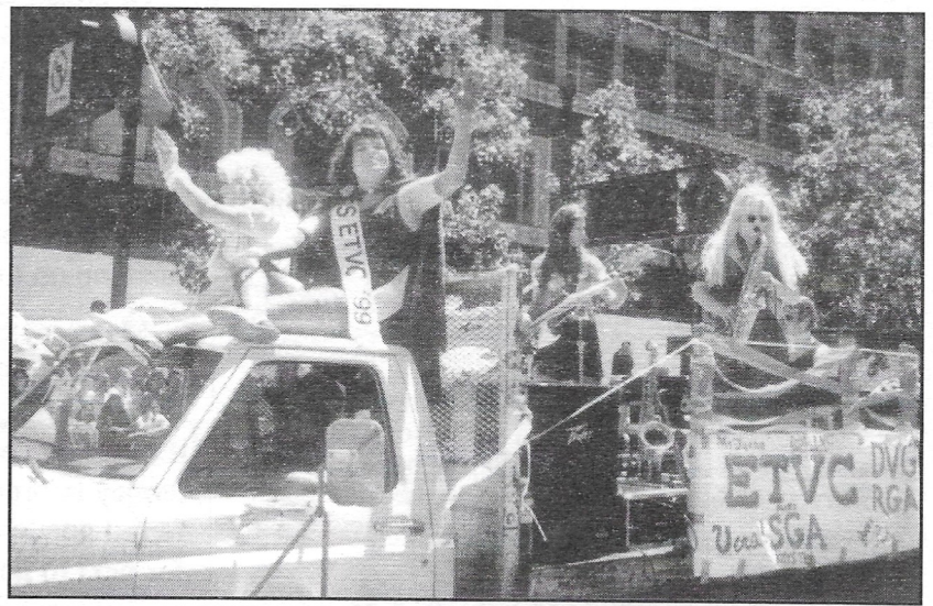
ETVC's "truck 'o' pride" at the 1997 LGBT Pride Parade