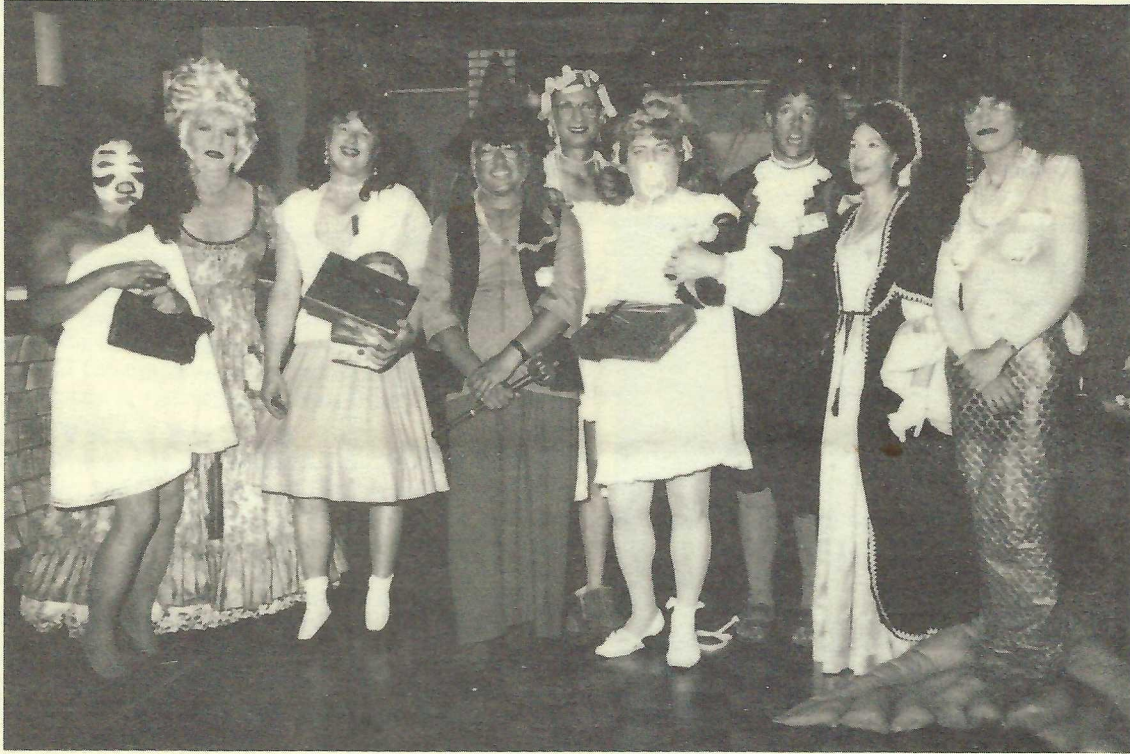
Our roving photojournalist captured this scene at the annual ETVC Halloween Party in October.