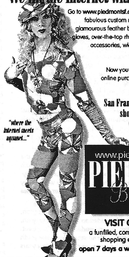
"where the internet meets aquanet..."

Go to www.piedmontsf.com and you'll find all of our fabulous custom made clothing, sexy lingerie, glamorous feather boas and hats, opera length gloves, over-the-top rhinestone jewelry, affordable accessories, wigs, makeup, hosiery, shoes, EVERYTHING... ONLINE!