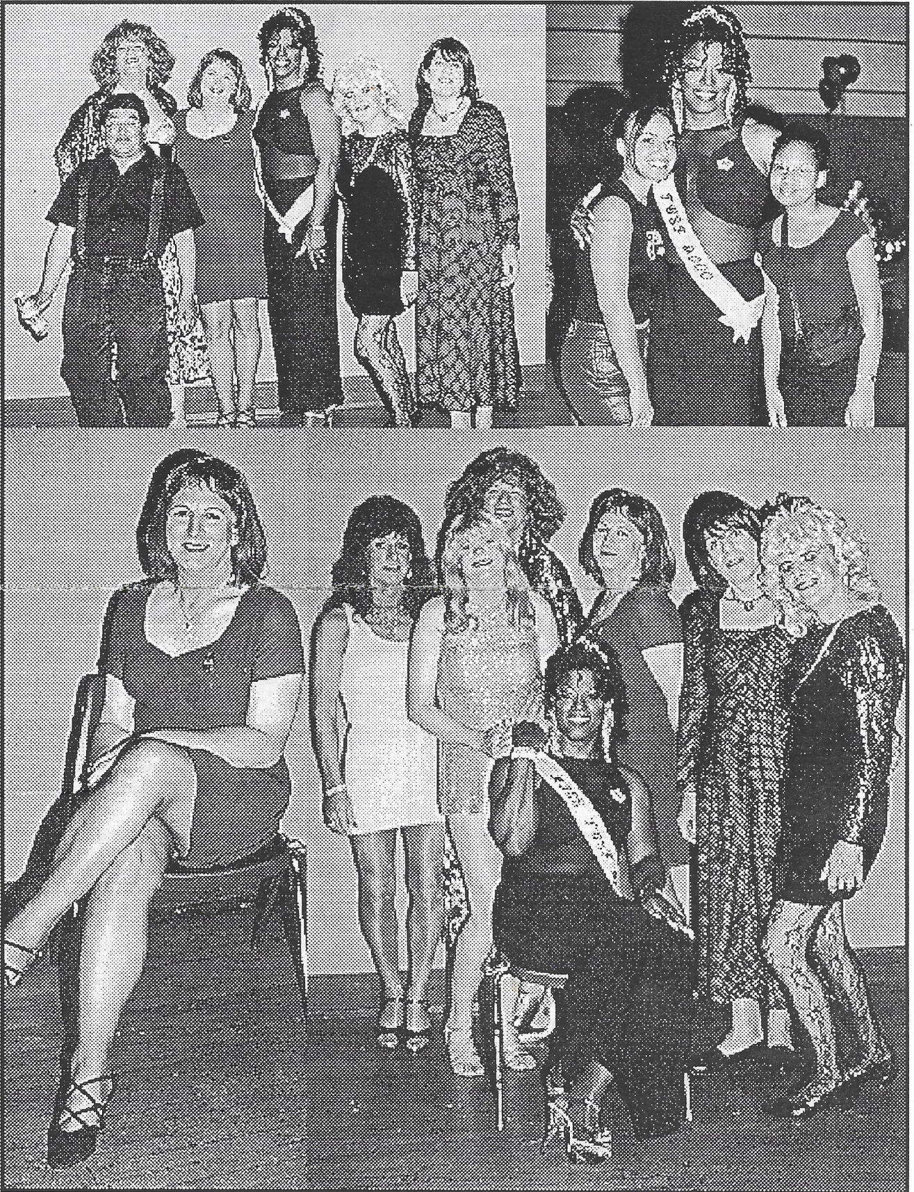
TGSF TransGender San Francisco is a group for all members of the Transgendered Community. Transgender is used as an umbrella term that includes female and male cross dressers, transvestites, drag queens or kings, female or male impersonators, intersexed individuals, pre-operative, post-operative and non-operative transsexuals, masculine females, feminine males, all persons whose perceived gender or anatomical sex may be incongruent with their gender expression, and all persons exhibiting gender characteristics and identities which are perceived to be androgynous.

The Channel TGSF TransGender San Francisco (formerly ETVC)