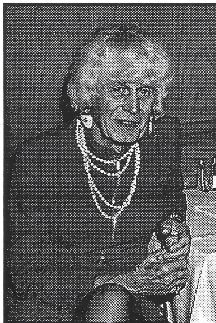
A TGSF Veteran Caught at the May Social

As you recall there were five issues on the special election ballot. The first two, which had been a subject of an earlier vote were straightforward and were incorporated into the Bylaws. The third item, the elimination of the membership year, was a bit more complicated. The third item would eliminate the concept of "the membership year", however section IV.D.1 of our Bylaws (voting eligibility) makes reference to "the membership year" and was not modified by the special election. If we were to implement the third item as is, it would result in an unworkable version of the Bylaws. As a result we cannot implement the third item until the revision has been made and voted on. Unfortunately, the discussion on the third item does not stop there. After receiving the database, the Secretary and I reviewed the work necessary to support the change in how we collect dues, and we have concluded that it is unimplementable. We have put over forty hours of work into the membership database (in a two week period), and have determined that it is approximately twelve times more difficult to maintain the membership database using the approach indicated by the third item in the special election.