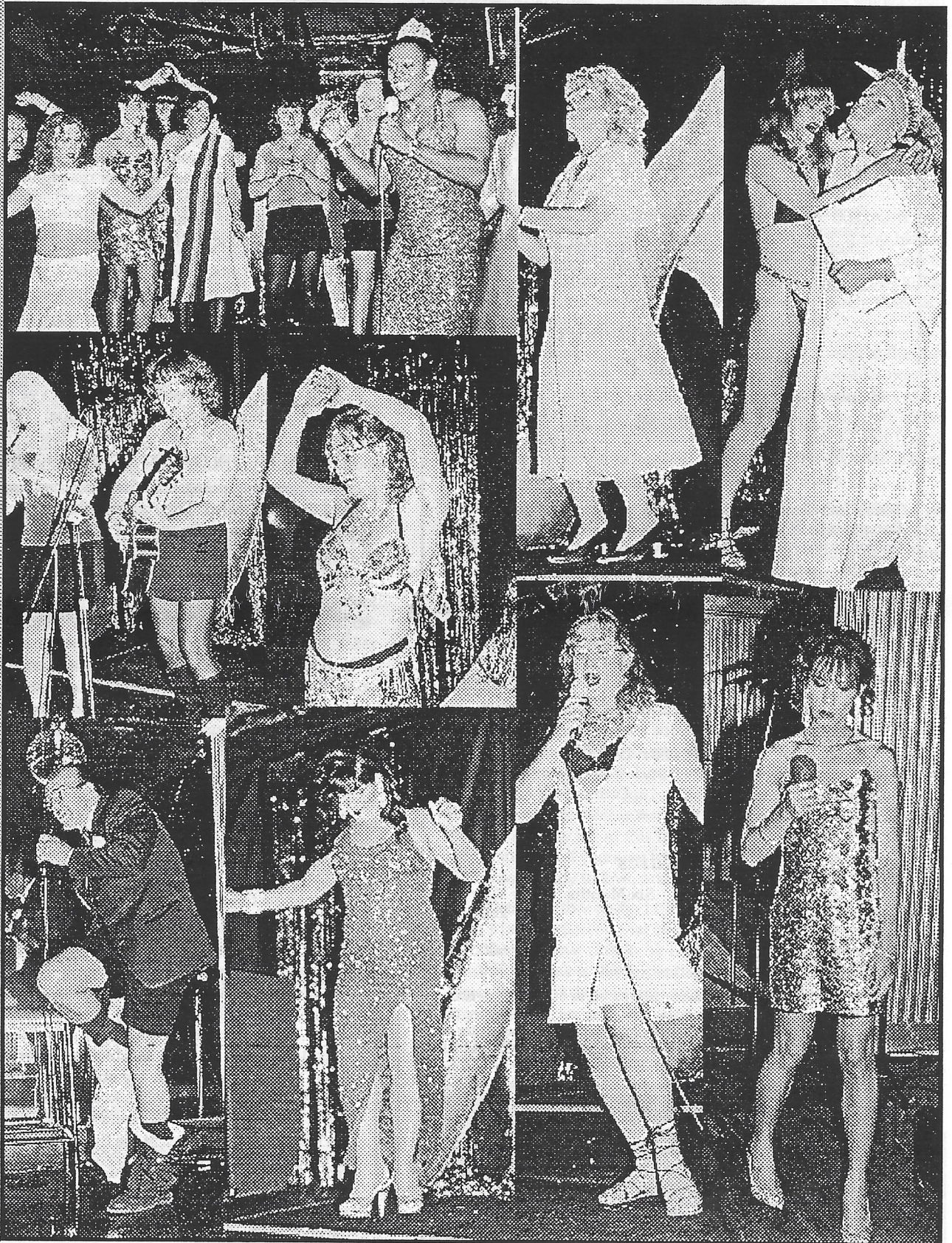
TGSF TransGender San Francisco is a group for all members of the Transgendered Community. Transgender is used as an umbrella term that includes female and male cross dressers, transvestites, drag queens or kings, female or male impersonators, intersexed individuals, pre-operative, post-operative and non-operative transsexuals, masculine females, feminine males, all persons whose perceived gender or anatomical sex may be incongruent with their gender expression, and all persons exhibiting gender characteristics and identities which are perceived to be androgynous.

TGSF TransGender San Francisco (formerly ETVC)