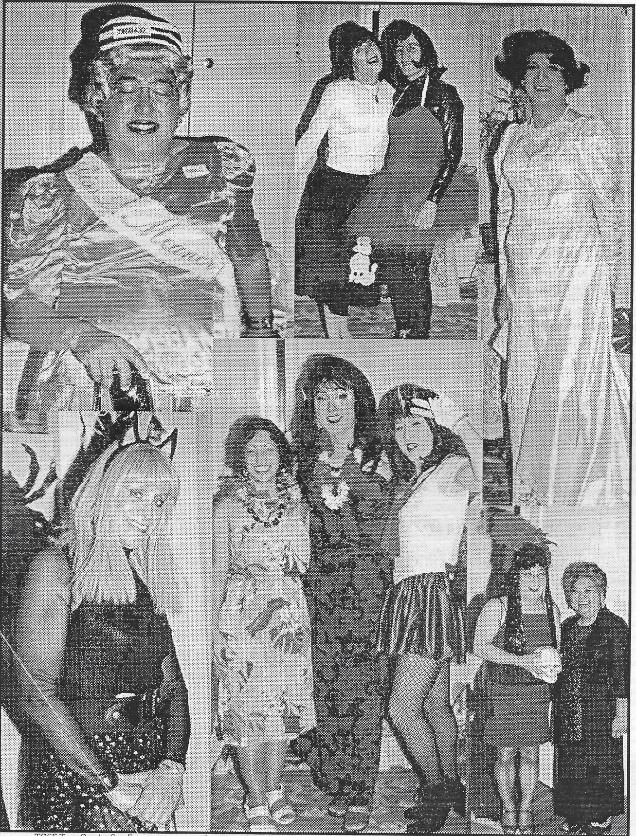
TGSF TransGender San Francisco is a group for all members of the Transgendered Community. Transgender is used as an umbrella term that includes female and male cross dressers, transvestites, drag queens or kings, female or male impersonators, intersexed individuals, pre-operative, post-operative and non-operative transsexuals, masculine females, feminine males, all persons whose perceived gender or anatomical sex may be incongruent with their gender expression, and all persons exhibiting gender characteristics and identities which are perceived to be androgynous.

TGSF's The Channel TransGender San Francisco (formerly ETVC)