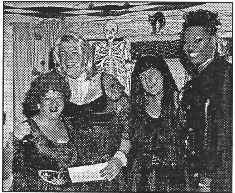
The Prez and Social Chair with Halloween Contest Winners

National Liberty Journal encourages readers to be diligent in protesting to the networks when offensive broadcasts are aired. Visit the NLJ Web site ( http://www.nljonline.com/network.htm ) to discover addresses, phone and fax numbers and E-mail addresses to the networks. The rapid moral decline on television will never stop until concerned viewers make their voices known to the networks and advertisers.