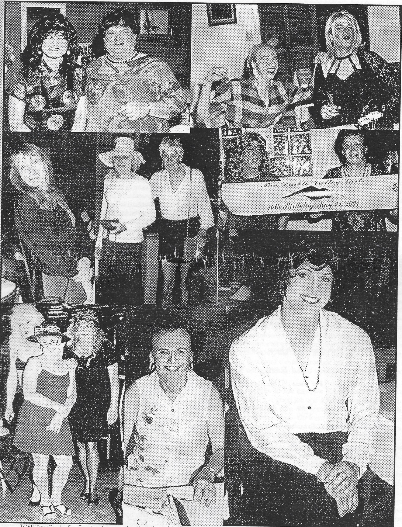
TGSF TransGender San Francisco is a group for all members of the Transgendered Community. Transgender is used as an umbrella term that includes female and male cross dressers, transvestites, drag queens or kings, female or male impersonators, intersexed individuals, pre-operative, post-operative and non-operative transsexuals, masculine females, feminine males, all persons whose perceived gender or anatomical sex may be incongruent with their gender expression, and all persons exhibiting gender characteristics and identities which are perceived to be androgynous.

TGSF The Channel TransGender San Francisco (formerly ETVC)