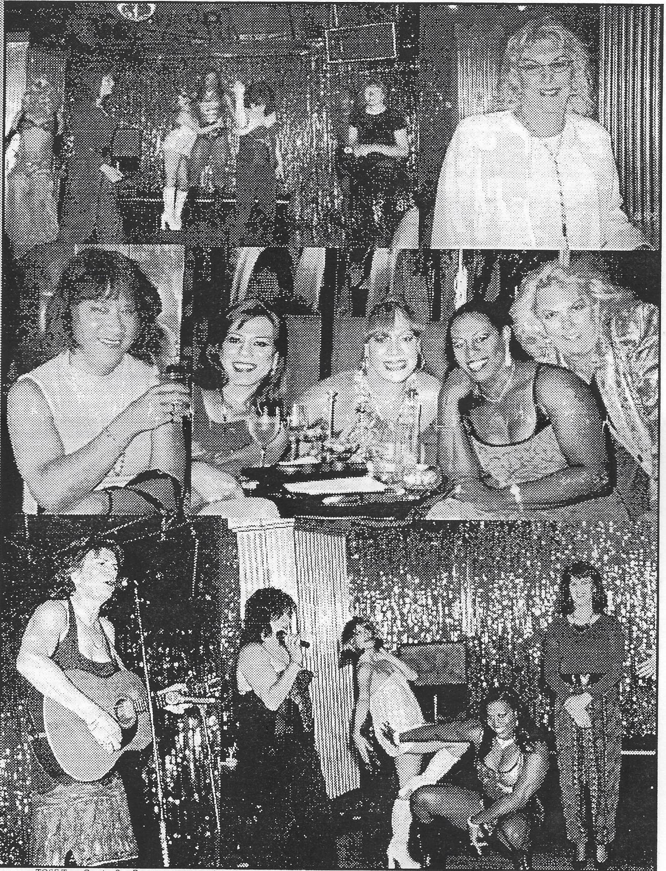
TGSF TransGender San Francisco is a group for all members of the Transgendered Community. Transgender is used as an umbrella term that includes female and male cross dressers, transvestites, drag queens or kings, female or male impersonators, intersexed individuals, pre-operative, post-operative and non-operative transsexuals, masculine females, feminine males, all persons whose perceived gender or anatomical sex may be incongruent with their gender expression, and all persons exhibiting gender characteristics and identities which are perceived to be androgynous.

TGSF The Channel TransGender San Francisco (formerly ETVC)