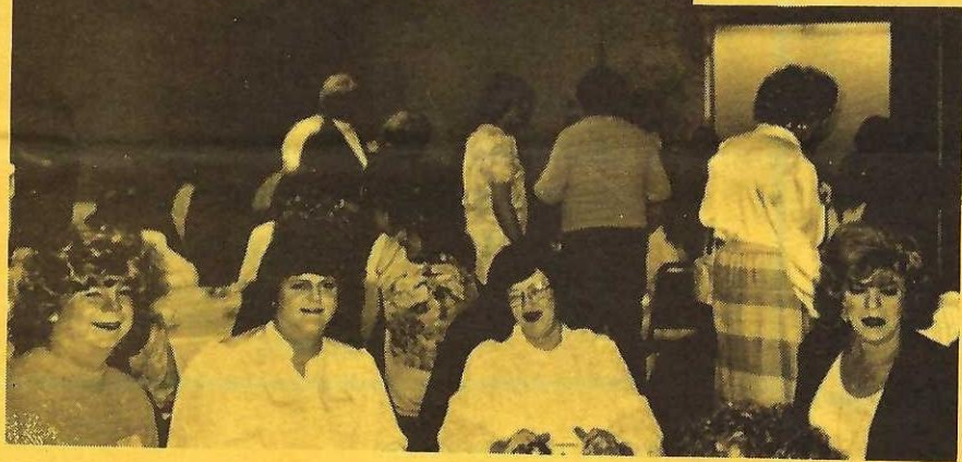
PHOTOS FROM THE I.F.G.E. CONVENTION

***** ★ MEMBERSHIP RENEWALS DUE JUNE 1 ★ ★ All memberships in ETVC, regardless of when ★ ★ purchased, need to be renewed as of June 1, ★ ★ 1987 at the annual rate of $10.00 for a full ★ ★ year of fun and good friendship. ★ ★*****