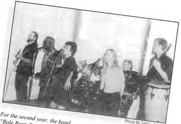
For the second year, the band "Bole Bantu" cooked at ETVC's Halloween Gala.

As the band played its final set, only one question remained that evening. "What will I wear next Halloween?"