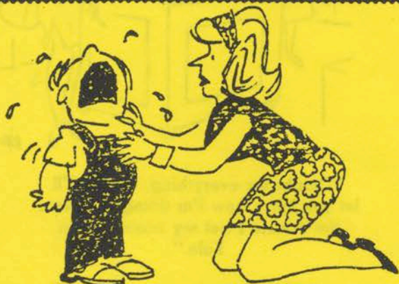
"I want a dress!"

Random ExComm notes...membership up to 158 compared to 81 at the same time last year...net proceeds from the Halloween and Fifties parties were $135.57 to bring the Treasury balance to $654.50.