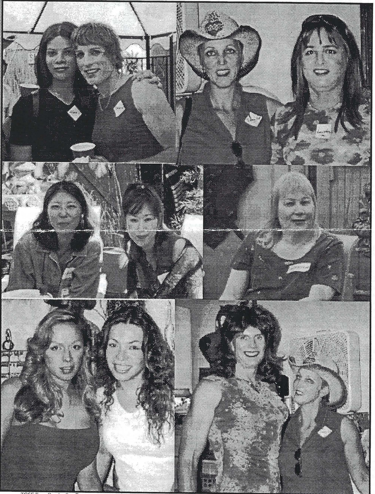
TGSF TransGender San Francisco is a group for all members of the Transgendered Community. Transgender is used as an umbrella term that includes female and male cross dressers, transvestites, drag queens or kings, female or male impersonators, intersexed individuals, pre-operative, post-operative and non-operative transsexuals, masculine females, feminine males, all persons whose perceived gender or anatomical sex may be incongruent with their gender expression, and all persons exhibiting gender characteristics and identities which are perceived to be androgynous.

TGSF is The Channel TransGender San Francisco (formerly E-FVC)