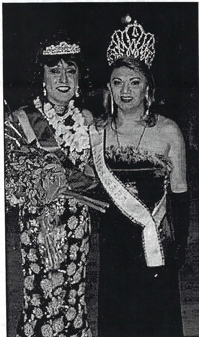
Miss TGSF with Miss GAPA