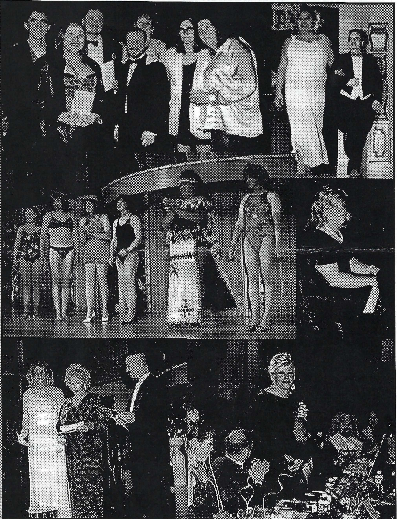
TGSF TransGender San Francisco is a group for all members of the Transgendered Community. Transgender is used as an umbrella term that includes female and male cross dressers, transvestites, drag queens or kings, female or male impersonators, intersexed individuals, pre-operative, post-operative and non-operative transsexuals, masculine females, feminine males, all persons whose perceived gender or anatomical sex may be incongruent with their gender expression, and all persons exhibiting gender characteristics and identities which are perceived to be androgynous.

TGSF is The Channel TransGender San Francisco (formerly ETVC)