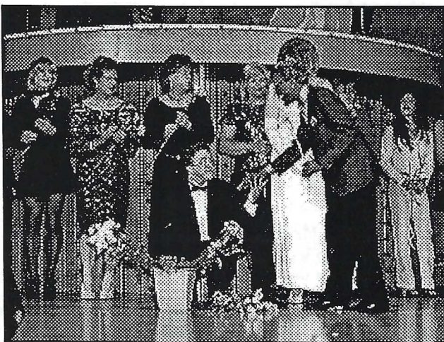
Debutantes receive their due at Cotillion 2002