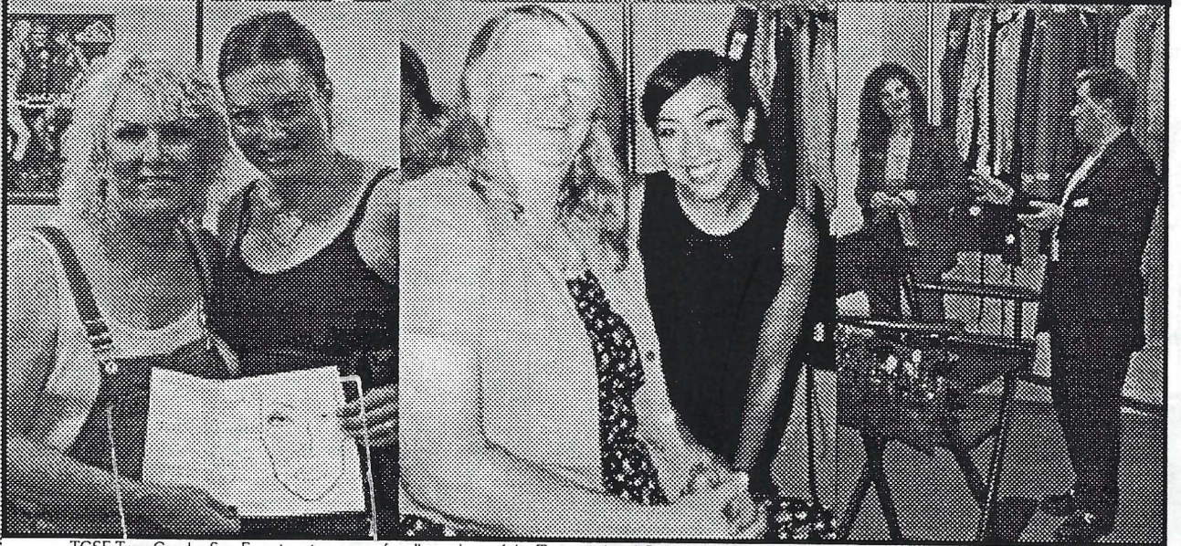
TGSF TransGender San Francisco is a group for all members of the Transgendered Community. Transgender is used as an umbrella term that includes female and male cross dressers, transvestites, drag queens or kings, female or male impersonators, intersexed individuals, pre-operative, post-operative and non-operative transsexuals, masculine females, feminine males, all persons whose perceived gender or anatomical sex may be incongruent with their gender expression, and all persons exhibiting gender characteristics and identities which are perceived to be androgynous.